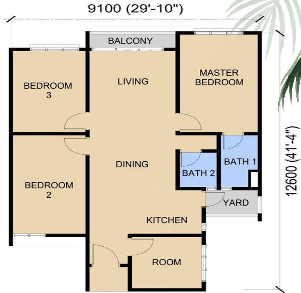
KOS BEBAS - Type B (1050 sqft)