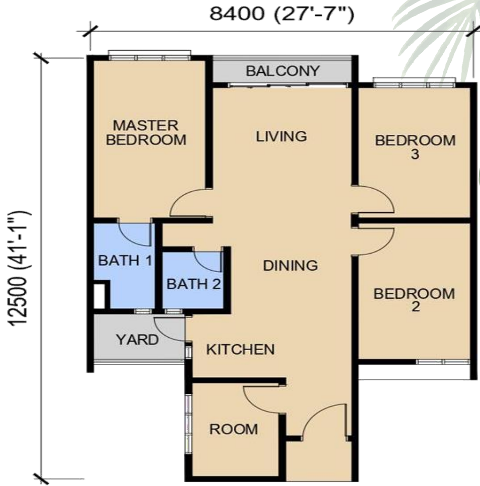
KOS BEBAS - Type A (930 sqft)